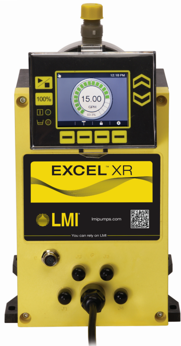
Pictured: Communications model

Selecting the right pump just got easier. No complicated configurations are necessary to find the right pump. With the Manual, Enhanced, and Communications models offered, simply pick the features that fit your needs (see page 6 for a complete list). Our models offer a wide range of functionality including backlit display, multilanguage, and 2-way communication to name only a few.