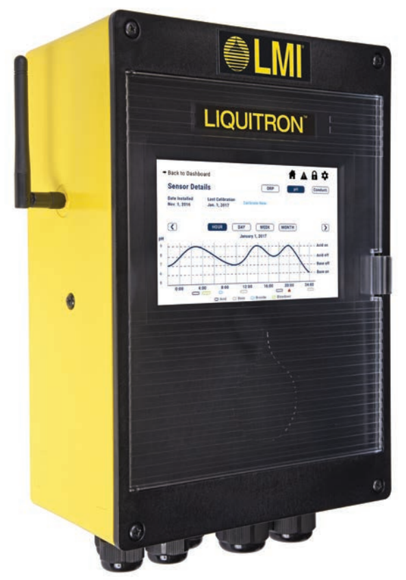
Robust Construction The sturdy IP55/NEMA 3R enclosure is suitable for indoor and outdoor installations.

The LIQUITRON 7500 Model is equipped with an embedded 4G/LTE cellular modem for connection to LMI Connect, Smart Monitoring Service. Remotely monitor and access your process via the LMI web portal or using iOS and Android apps. LMI Connect shows real-time status, notifies users of any alerts