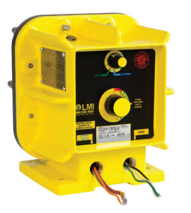
.001 to 20 GPH (4.9 to 78. I/h) Max: 300 PSI (20.7 Bar)