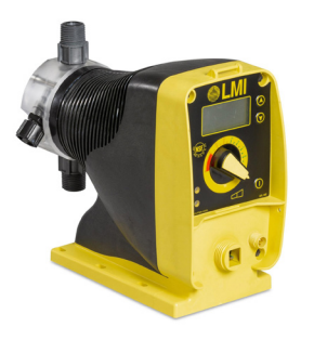
.002 to 2 GPH (.8 to 7.6 l/h) Max: 250 PSI (17.2 Bar)