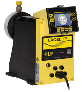
.006 to 53 GPH (.023 to 203 l/hr) Max: 175 PSI (12.0 Bar)