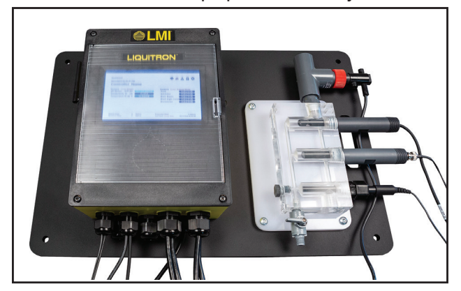
Simplify your installation process with ready-to-mount pre-engineered panels available through local distribution.