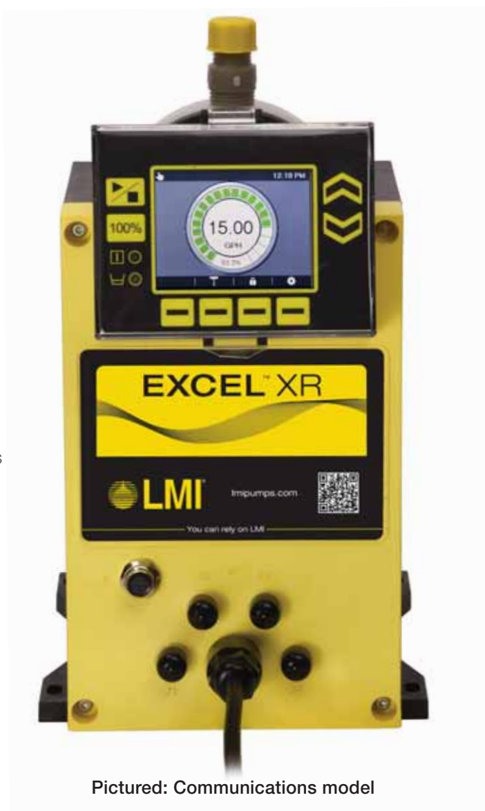
Pictured: Communications model

Selecting the right pump just got easier. No complicated configurations are necessary to find the right pump. With the Manual, Enhanced, and Communications models offered, simply pick the features that fit your needs (see page 6 for a complete list). Our models offer a wide range of functionality including backlit display, multilanguage, and 2-way communication to name only a few.