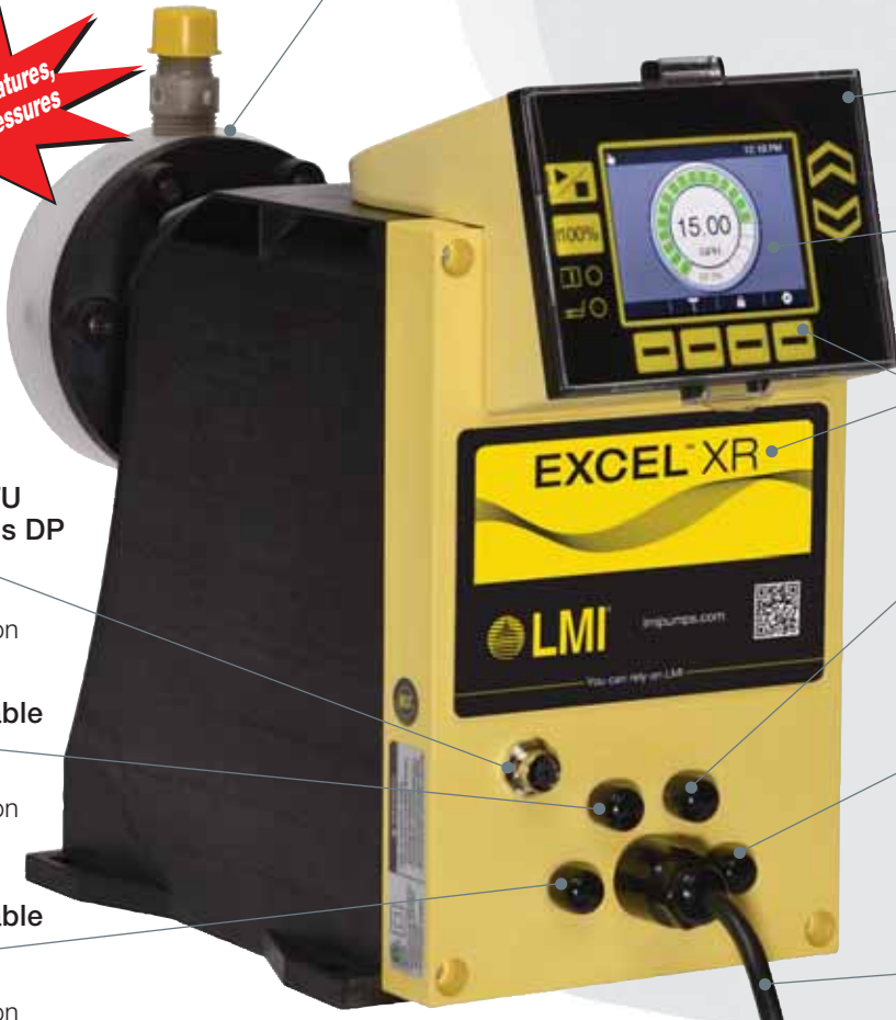
Pictured: Communications model